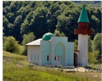
Ecumenical Center - mosque

I called you in good time and waited to come to your senses and believe that I come with the disaster over those you spoiled My law, holy days and time defiling My church. ( See selection topic: "The changing of the holidays – renunciation of faith", r.n. ). But you did not bend down because you had on you those stolen from Me and because you are fearful. But I am the righteous God and you are a thief and have stolen My vineyard and sit as a master over it. I will devastate you as I devastate Jerusalem which I fied Me two thousand years ago. I waited for you to fasten the tents of your palace in the land of the glory to destroy you afterwards.