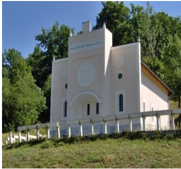
Ecumenical Center - synagogue

It is written in the Scriptures about the mystery of the New Jerusalem. When you saw that I came from heaven on earth to fulfill it, you became conceited and perked up against the righteous ones that I am glorifying over the earth in, and arose to do what I do. You wanted to forget that the New Jerusalem is a holy name; it is the mystery of the last days and it is for saints, not for adulterers. The New Jerusalem is not a place for sinners and adulterers' meeting; it is not a place for eating, drinking and dancing, the same as you made towers of stone for yourself and sat greatly on them and wrote on them " The New Jerusalem "; however you wrote, as you say, " The Center of the Faithful world ", " The Ecumenical Center ", this is what you wrote. You sold Me for money and for expensive places to Me; places from the country of My coming back, and put on them the fruit of your conceitedness to make war against God and to win Him over to your side; but you are sinful, and I do not listen to you and I do not receive you.