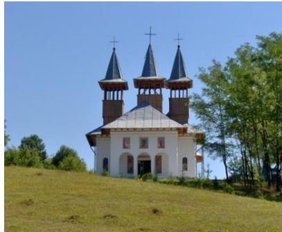
Ecumenical Center - church